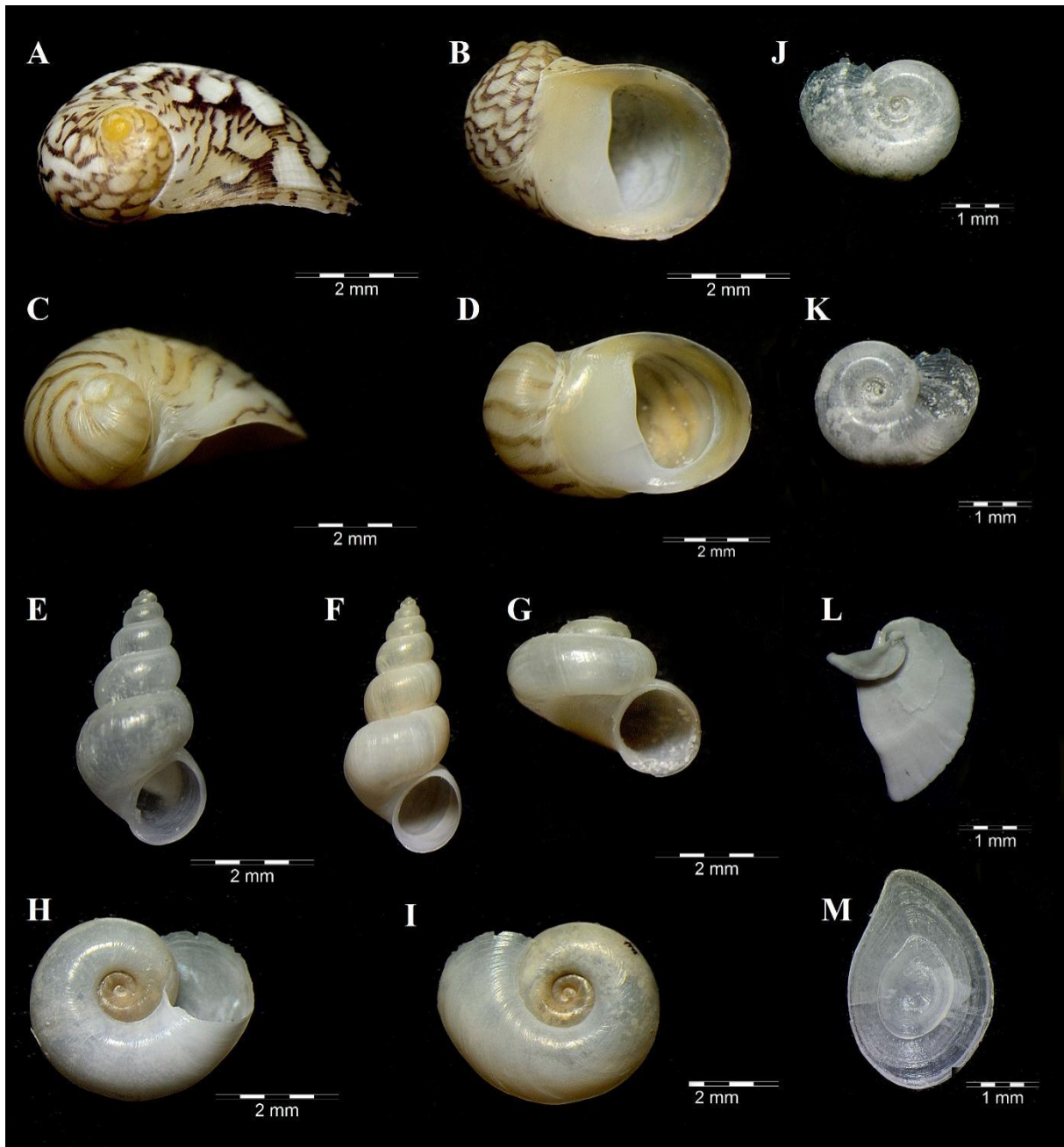
Figure 2. A-B. Theodoxus fluviatilis, C-D. T. major, E. Ecrobia maritima, F. E. ventrosa, G. Valvata macrostoma, H-I. Gyraulus piscinarum, J-K. Armiger crista, L. operculum ( T. fluviatilis), M. operculum ( Bithynia sp.)