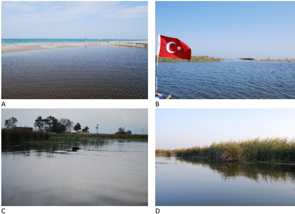
Figure 3. A-B. Connection of Karaboğaz Lake and Liman Lake with the sea; C. Livestock activities (buffalo farming) carried out in the research area; D. Liman Lake-4 station from the research area.

close to the sea and partly isolated from the sea by dunes formed due to sea waves (Figure 3).